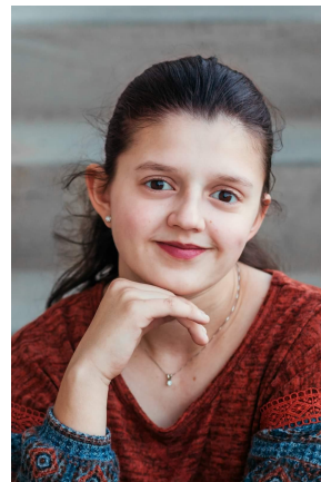
12th Grade Streator High School