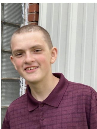
8th Grade Homeschool