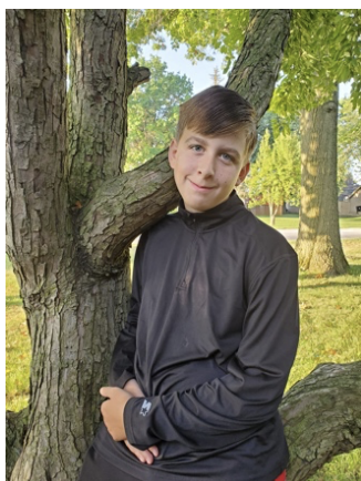
8th Grade Lawton Homeschool Academy