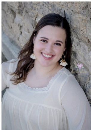
12th Grade Streator High School