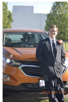
12th Grade Streator Township High School