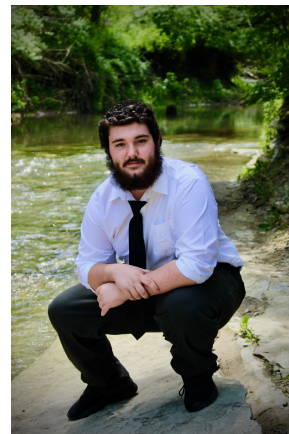
12th Grade Woodland High School