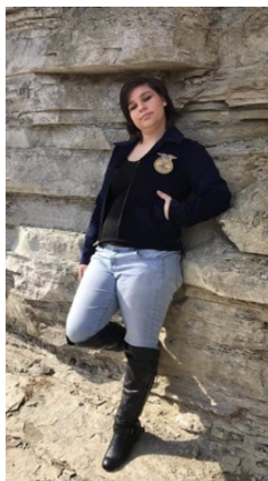
12th Grade Woodland High School