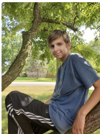
12th Grade Lawton Homeschool Academy