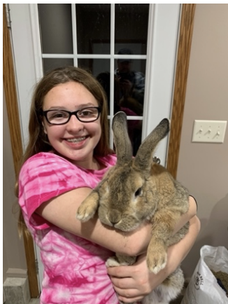
8th Grade Grand Ridge Grade School